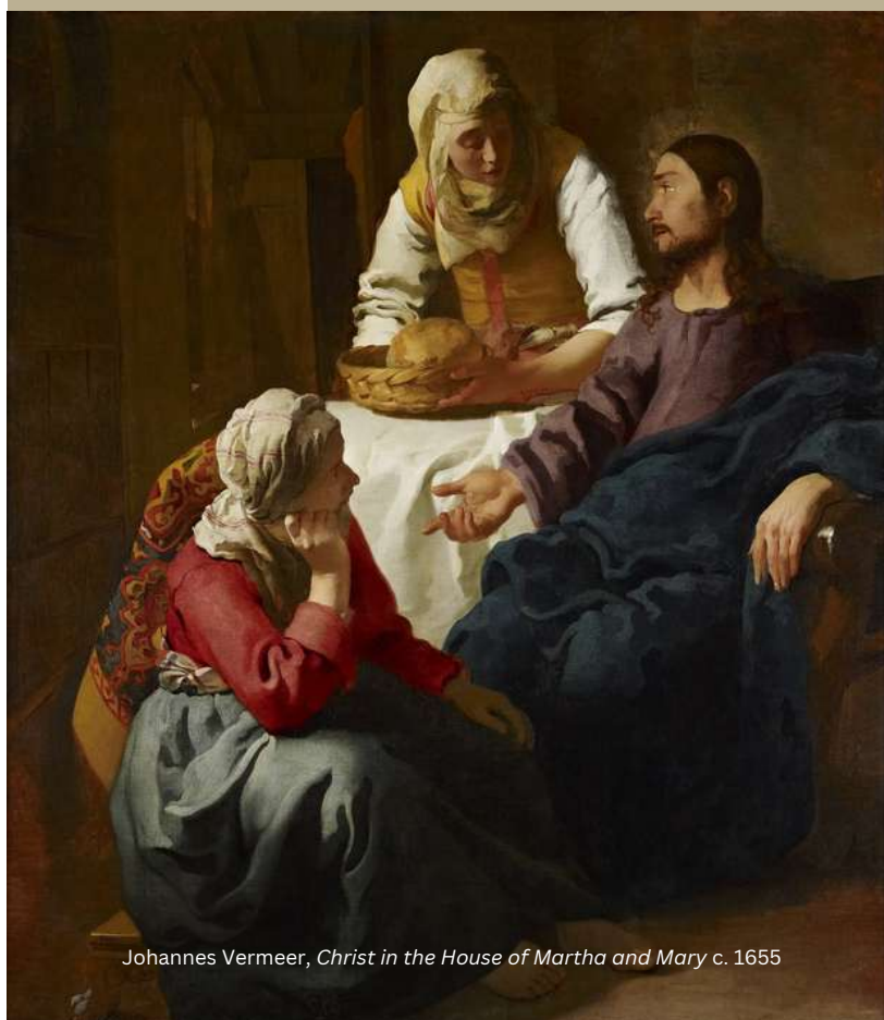
Johannes Vermeer, Christ in the House of Martha and Mary c. 1655

It is certain there was early devotion to the saint. Around the year 390, the pilgrim lady Etheria talks of the procession that took place on the Saturday before Palm Sunday at the tomb where Lazarus had been raised from the dead. In the West, Passion Sunday was called Dominica de Lazaro , and Augustine tells us that in Africa the Gospel of the raising of Lazarus was read at the office of Palm Sunday.