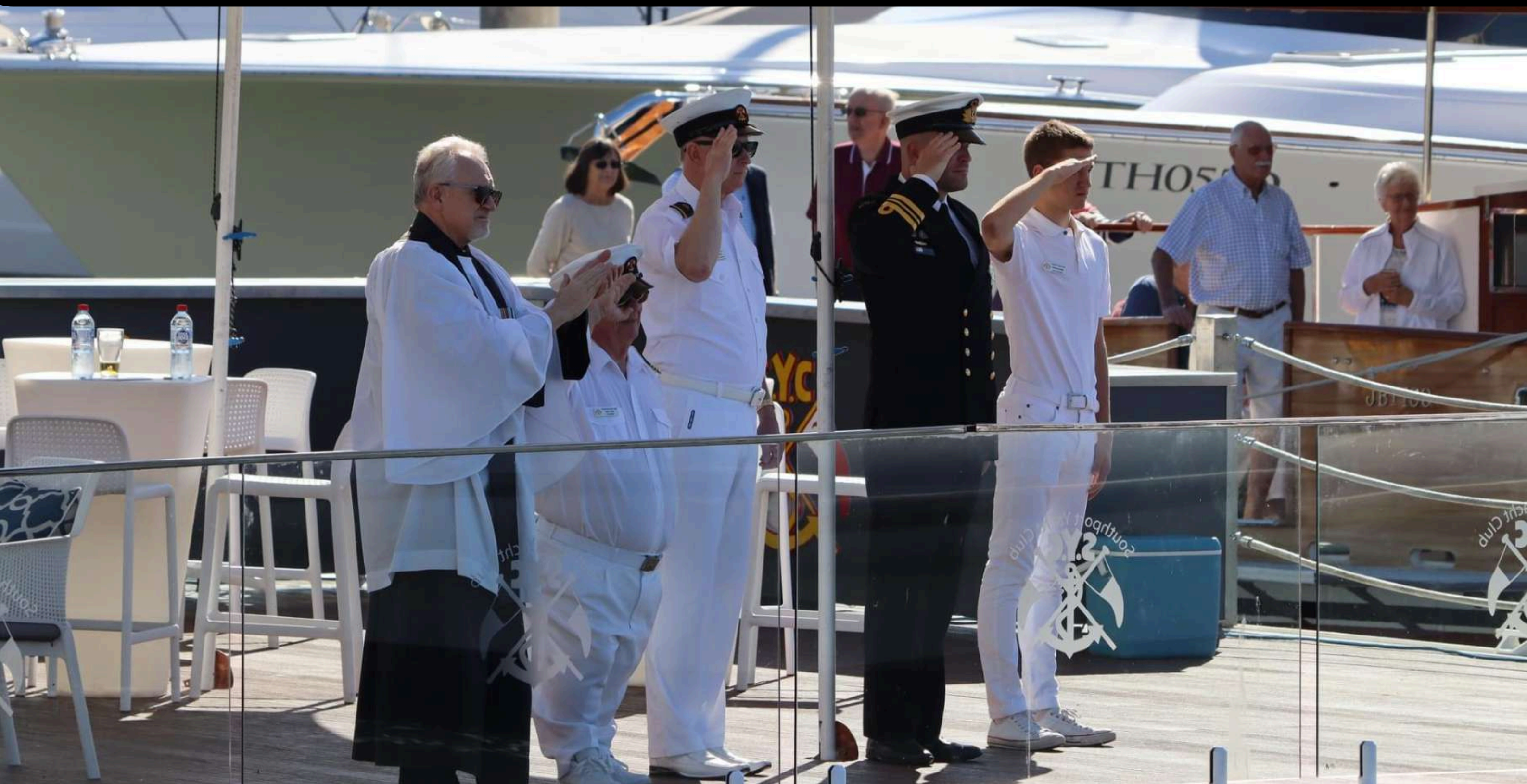
“The Blessing of the Fleet” ~ Southport Yacht club ~ Saturday 14 September