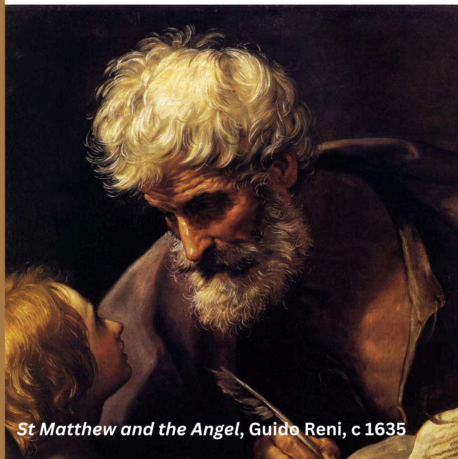
St Matthew and the Angel, Guido Reni, c 1635

1 I therefore, the prisoner in the Lord, beg you to lead a life worthy of the calling to which you have been called, 2 with all humility and gentleness, with patience, bearing with one another in love, 3 making every effort to maintain the unity of the Spirit in the bond of peace. 4 There is one body and one Spirit, just as you were called to the one hope of your calling, 5 one Lord, one faith, one baptism, 6 one God and Father of all, who is above all and through all and in all. 7 But each of us was given grace according to the measure of Christ's gift. 8 Therefore it is said, 'When he ascended on high he made captivity itself a captive; he gave gifts to his people.' 9 (When it says, 'He ascended', what does it mean but that he had also descended into the lower parts of the earth? 10 He who descended is the same one who ascended far above all the heavens, so that he might fill all things.) 11 The gifts he gave were that some would be apostles, some prophets, some evangelists, some pastors and teachers, 12 to equip the saints for the work of ministry, for building up the body of Christ, 13 until all of us come to the unity of the faith and of the knowledge of the Son of God, to maturity, to the measure of the full stature of Christ. 14 We must no longer be children, tossed to and fro and blown about by every wind of doctrine, by people's trickery, by their craftiness in deceitful scheming.