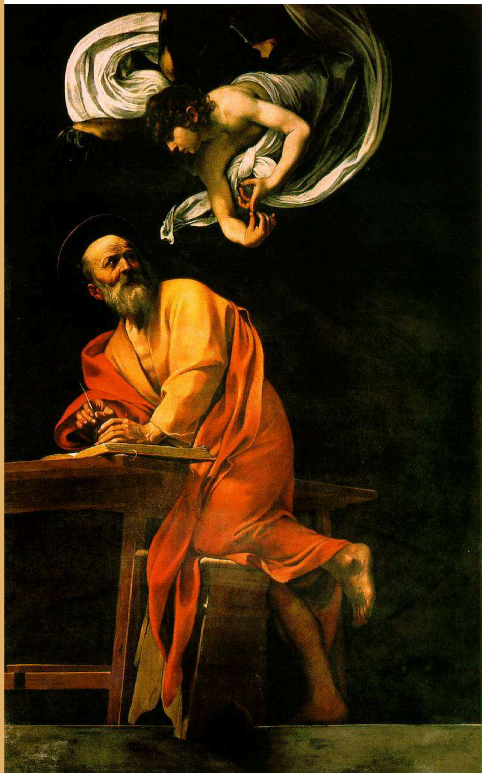
Caravaggio, St Michael and the Angel , 1602

Reflecting on St. Matthew's calling, from the pursuit of dishonest financial gain to the heights of holiness and divine inspiration, Pope Benedict said in 2006 that “in the figure of Matthew, the Gospels present to us a true and proper paradox: those who seem to be the farthest from holiness can even become a model of the acceptance of God's mercy and offer a glimpse of its marvellous effects in their own lives.”