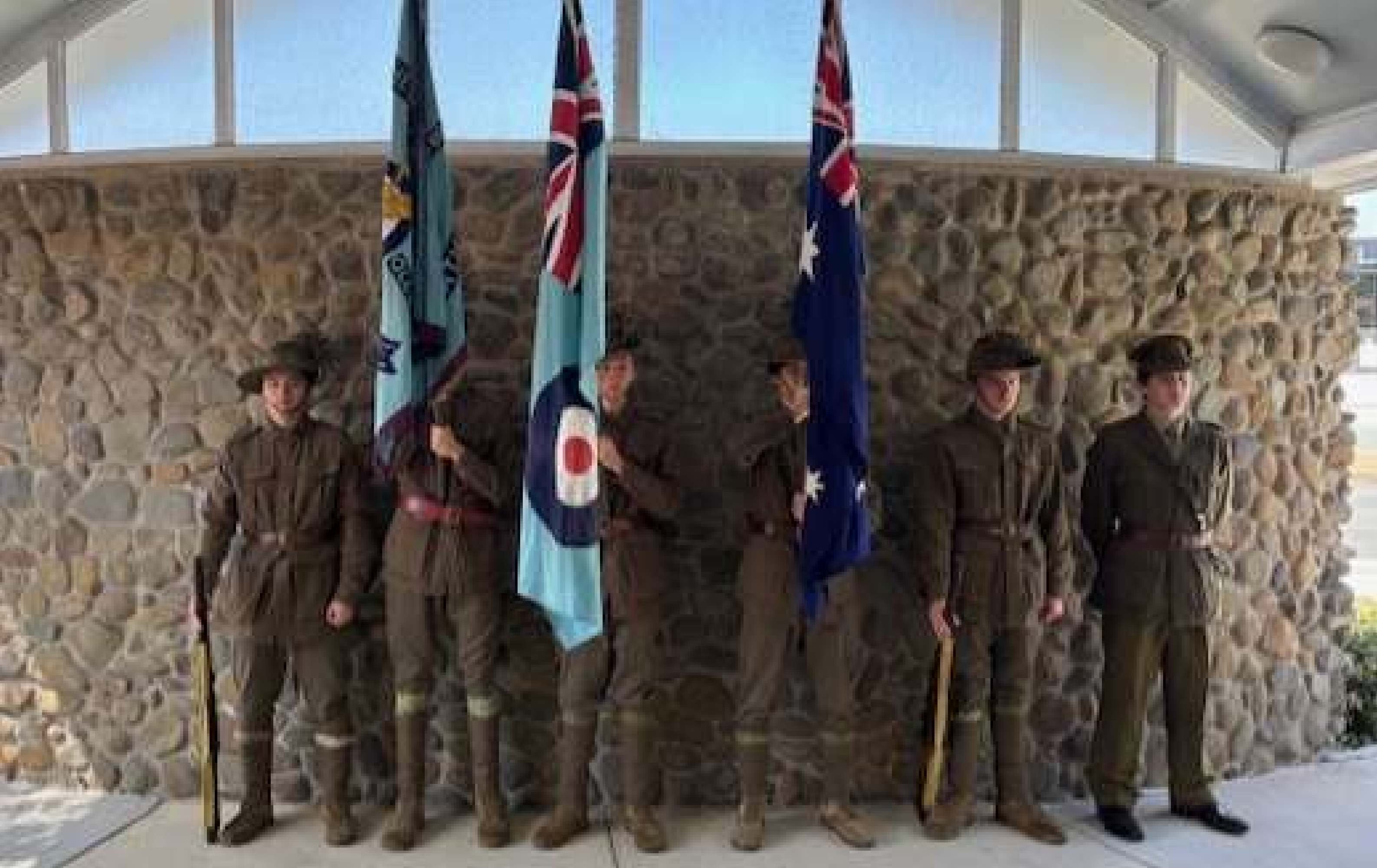
The TSS Cadet flag party joined us on Battle of Britain Sunday~ 15 September ~