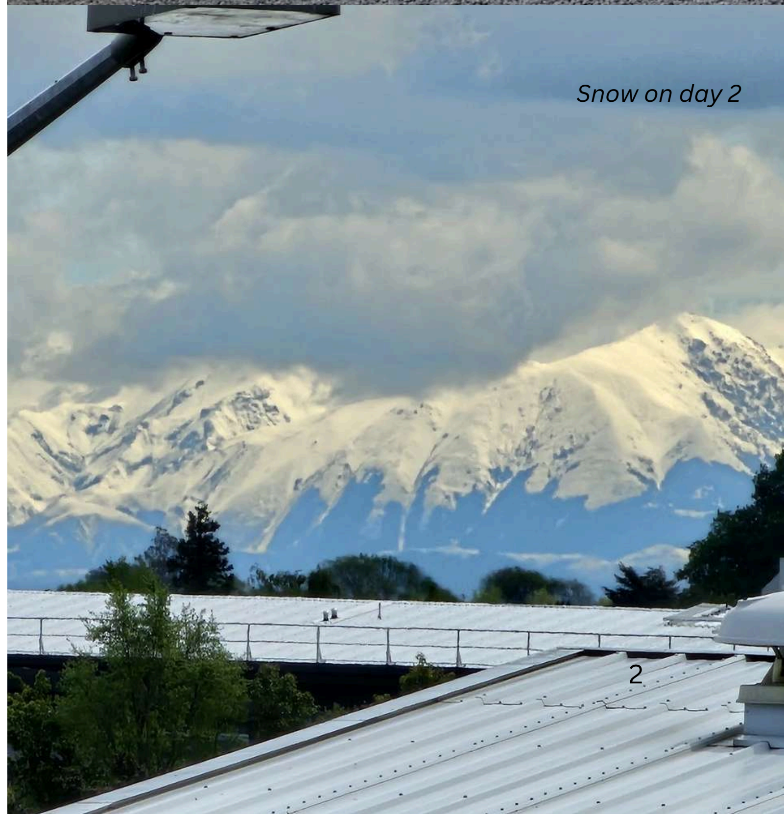
Snow on day 2