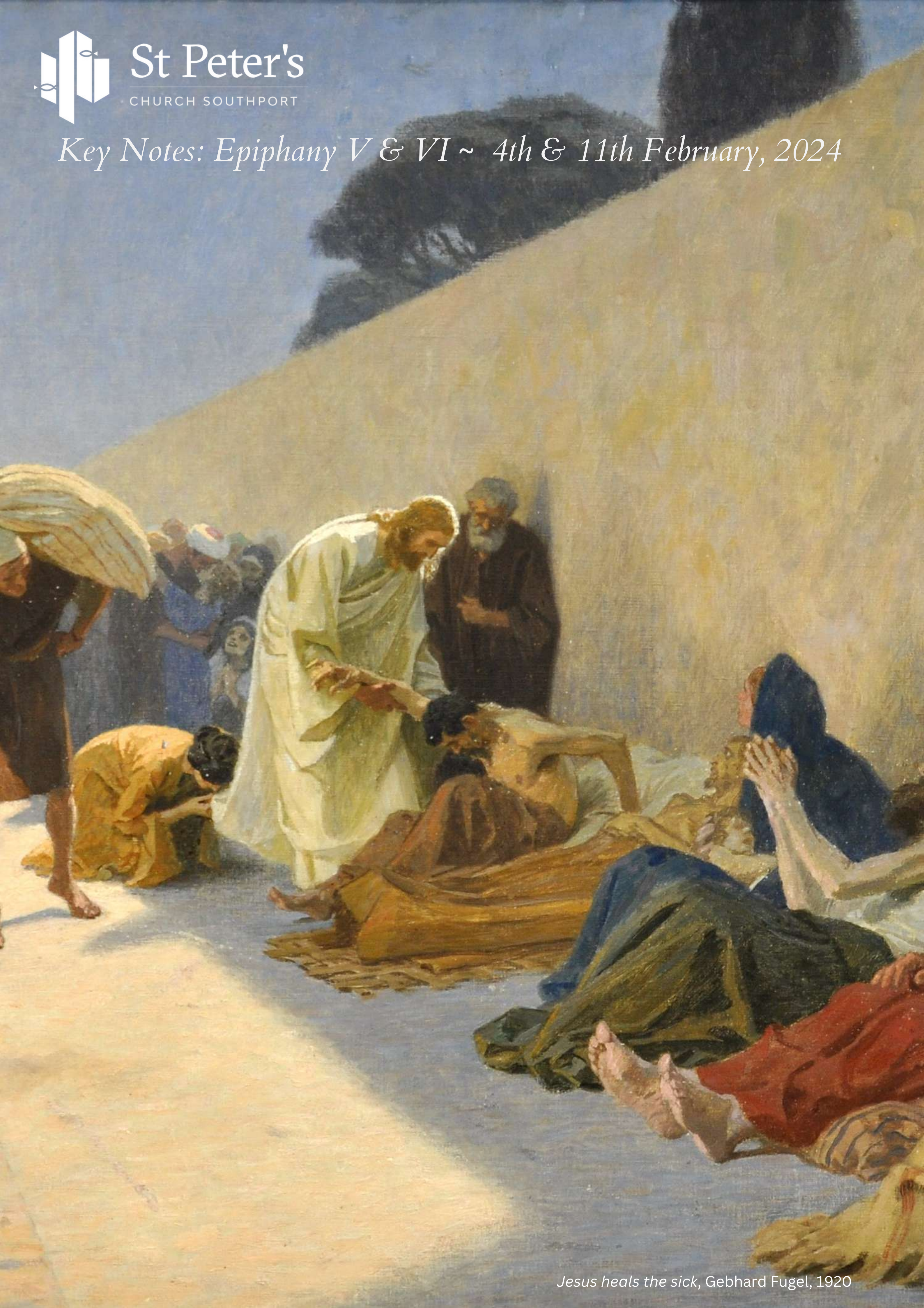
Jesus heals the sick, Gebhard Fugel, 1920

Key Notes: Epiphany V & VI ~ 4th & 11th February, 2024